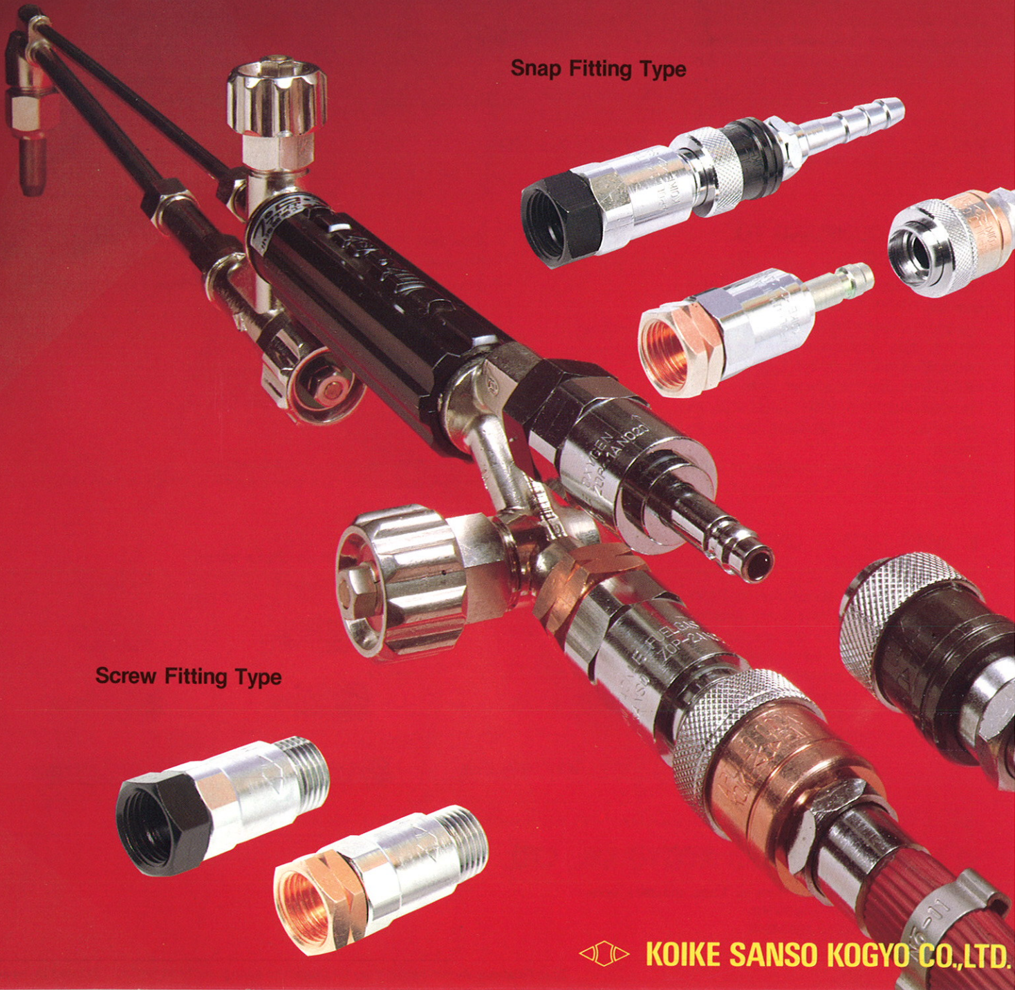
Snap Fitting Type

The APOLLO-MINI TACKLE with its perfect flashback arrestor, assures safer and greater cutting performance.